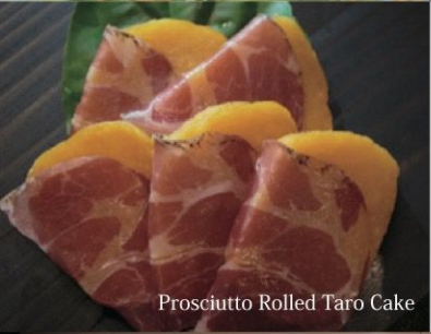
Prosciutto Rolled Taro Cake