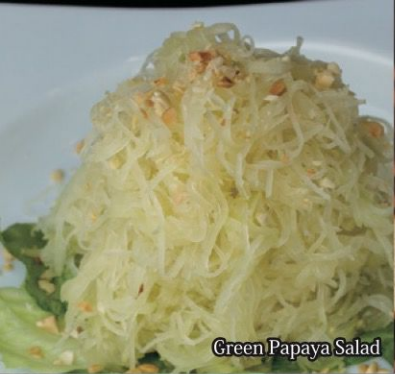
Green Papaya Salad