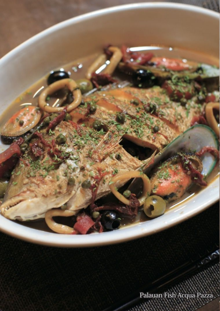
Palauan Fish Acqua Pazza